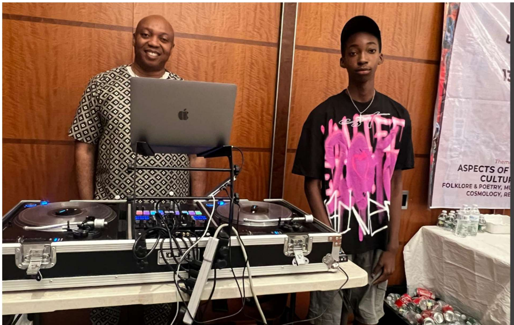
DJ at the Closing Ceremony & Gala Night, Saturday, July 27, 2024