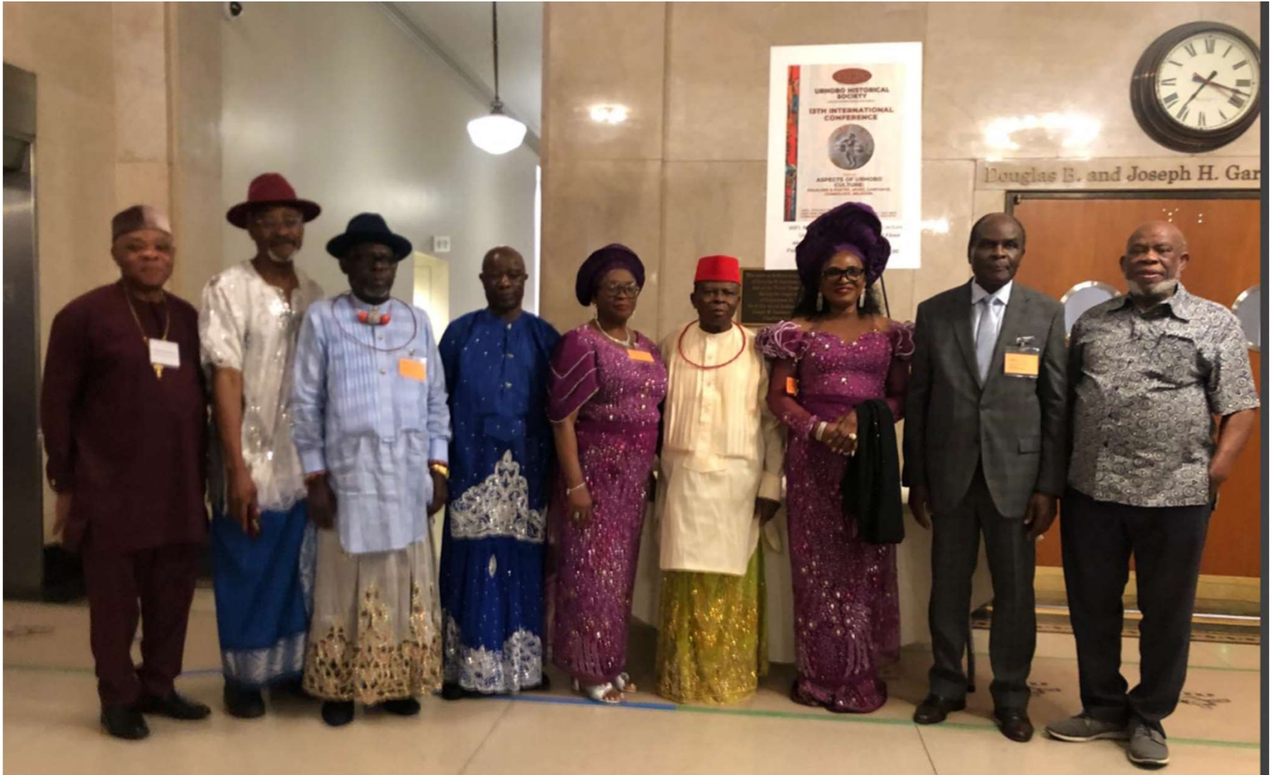
Urhobo Historical Society EMC members, present at the 2024 Conference in New York City.