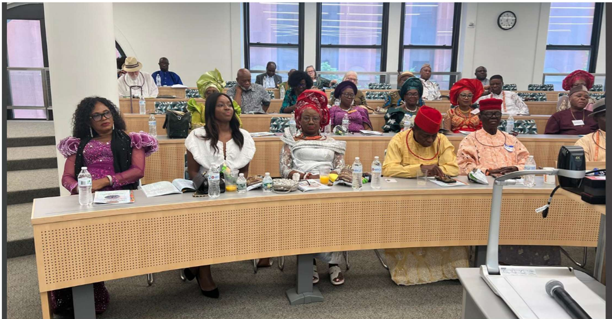
At the Opening Ceremony and Plenary Sessions