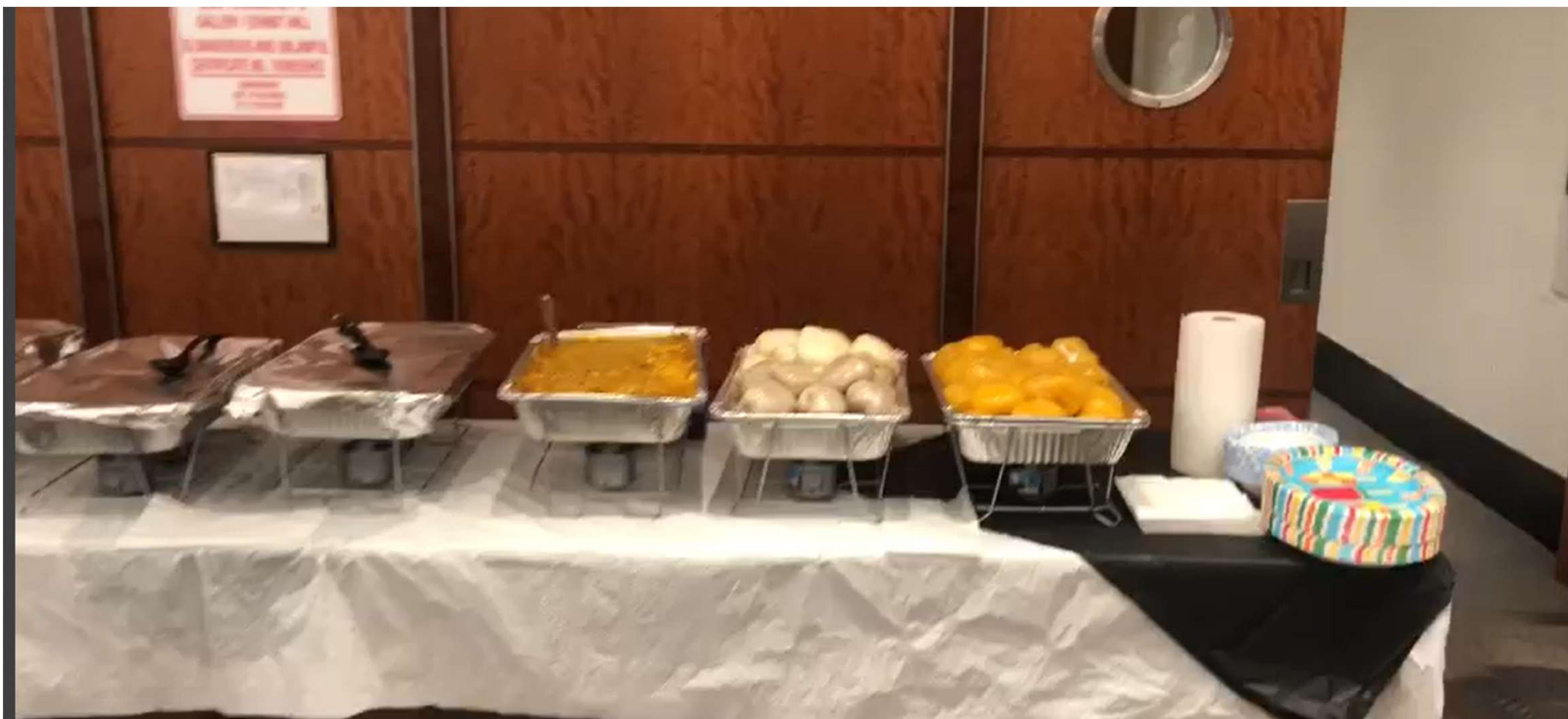
Assorted Food, including Urhobo Dishes At the Closing Ceremony & Gala Night, Saturday, July 27, 2024