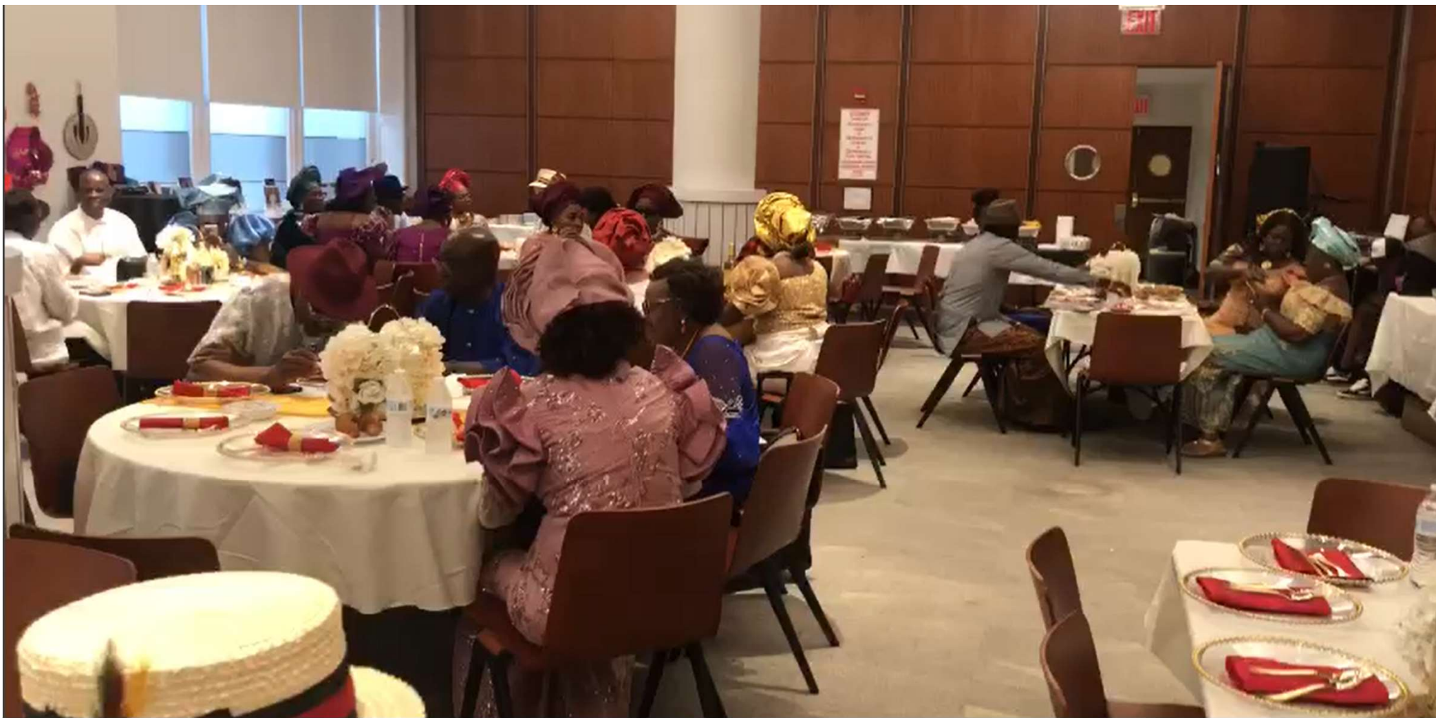
At the Closing Ceremony & Gala Night, Saturday, July 27, 2024