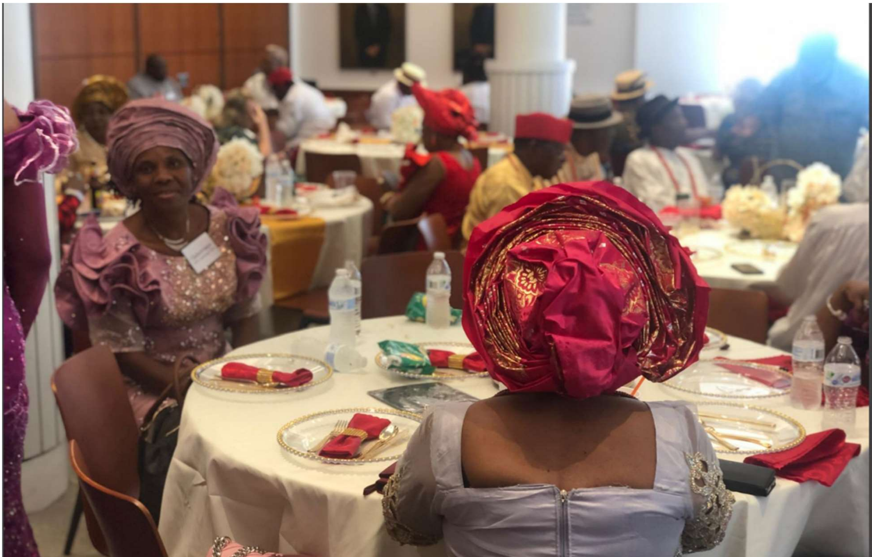
At the Closing Ceremony & Gala Night, Saturday, July 27, 2024