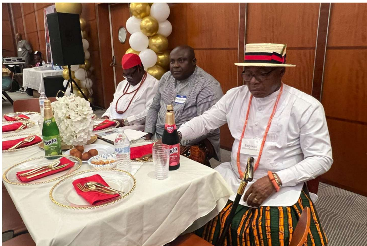
At the Closing Ceremony & Gala Night, Saturday, July 27, 2024