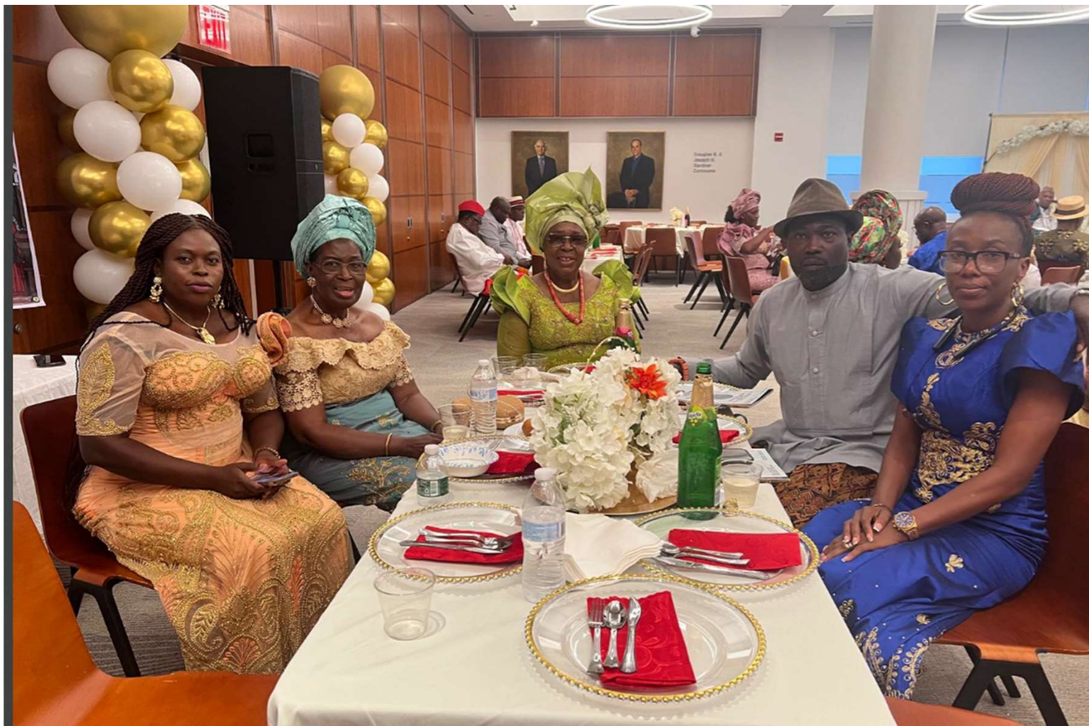
At the Closing Ceremony & Gala Night, Saturday, July 27, 2024