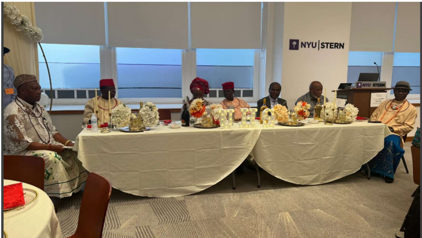
High Table at the Closing Ceremony & Gala Night, Saturday, July 27, 2024