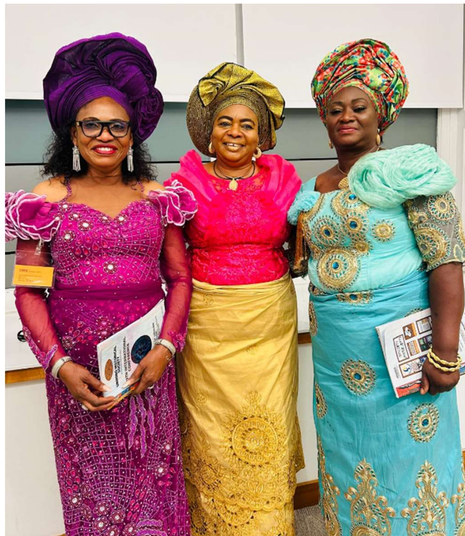
Some members of the Local Organizing Committee (LOC)