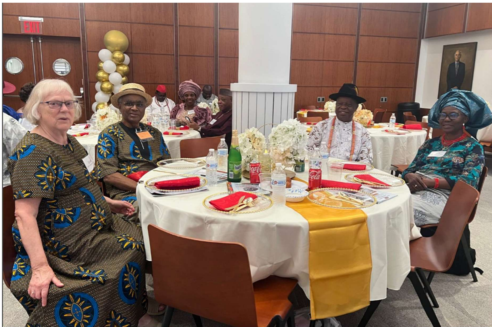
At the Closing Ceremony & Gala Night, Saturday, July 27, 2024