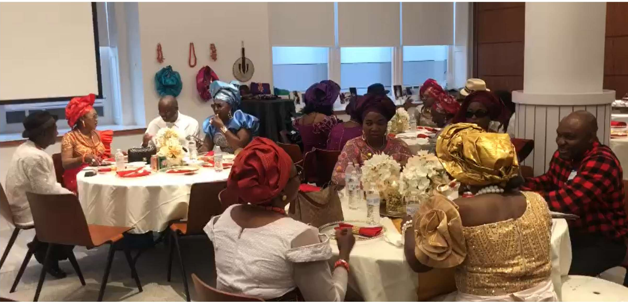
At the Closing Ceremony & Gala Night, Saturday, July 27, 2024