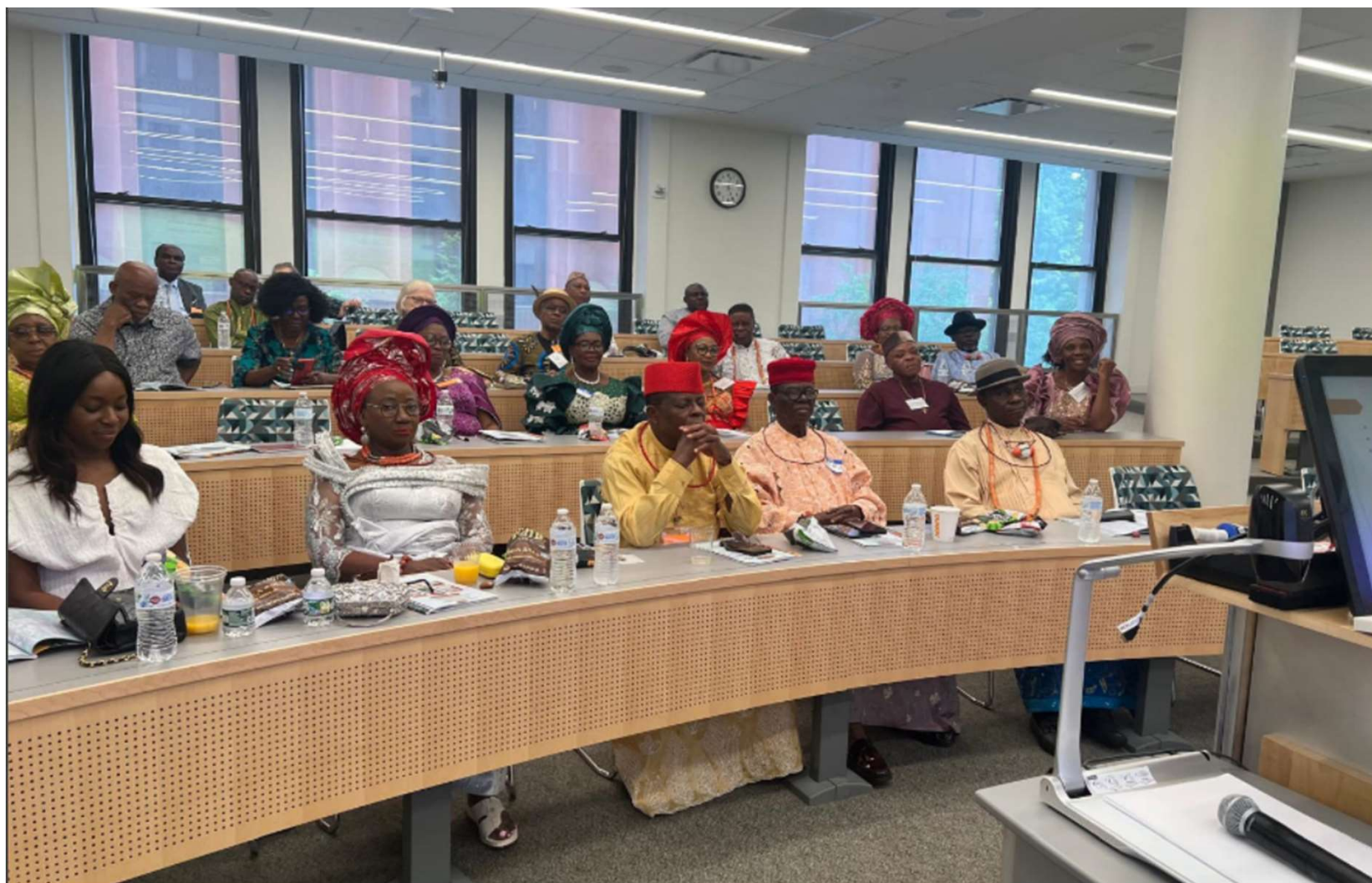
At the Opening Ceremony and Plenary Sessions