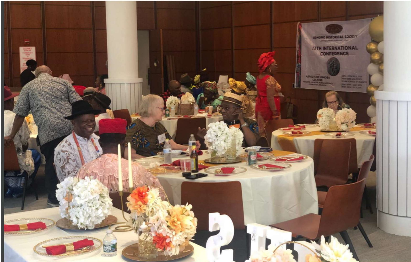
At the Closing Ceremony & Gala Night, Saturday, July 27, 2024