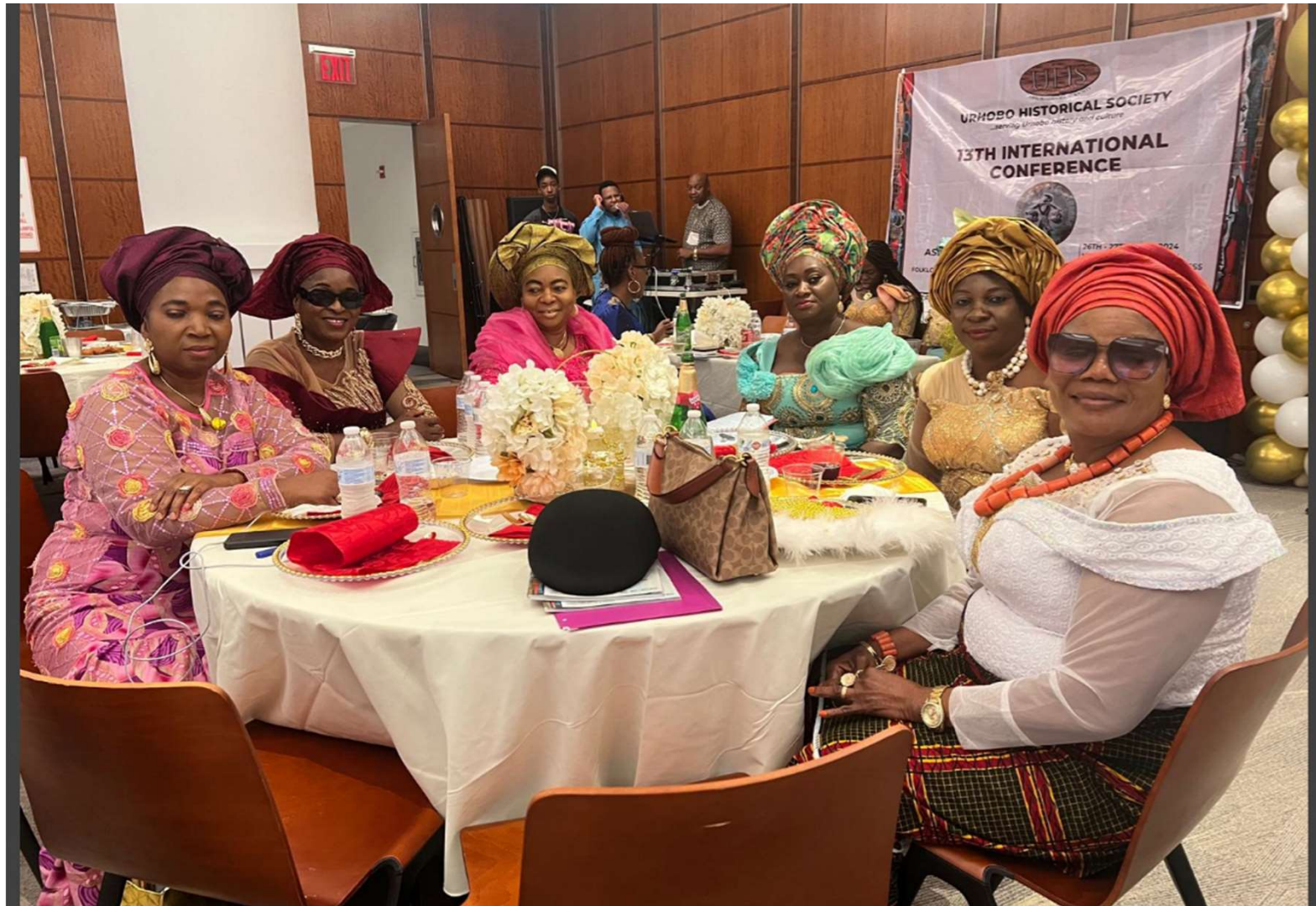
At the Closing Ceremony & Gala Night, Saturday, July 27, 2024